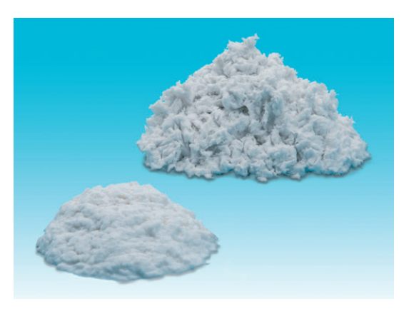
Figure 1 TOMBO™ No.5675 "FINEFLEX BIO™ CAST"

struction into special shapes and complicated positions. As listed in Table 1 , the product line-up includes two general-purpose types (standard and high-density) suitable for troweling construction, and one type for pumping construction, which can be selected depending on the application.