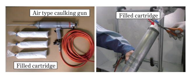
Figure 3 Air type caulking gun and cartridge loading

an air type caulking gun, and then injected into the target positions (Figure 3). This method is effective especially when the construction targets are scattered or for construction with a medium amount of material.