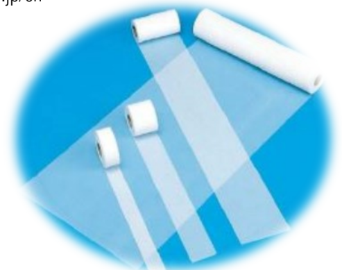
NAFLON™ PTFE Tape